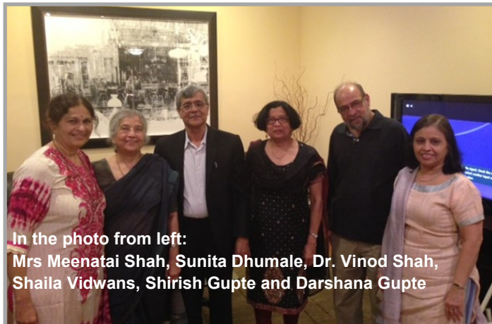
In the photo from left: