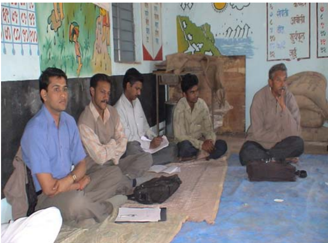
NGO meeting held in December 2006 in Jamunala village in Chikhaldara.