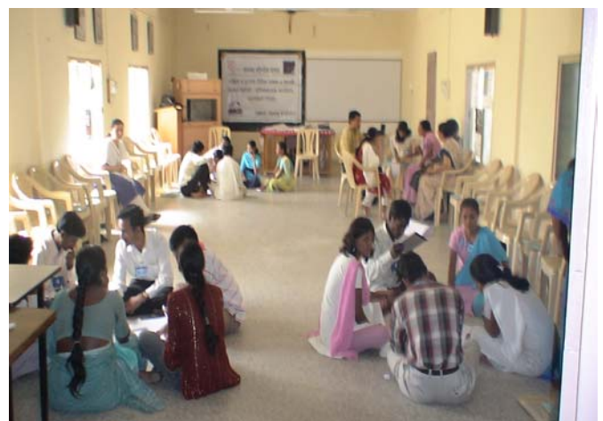
Training workshop for field workers in progress