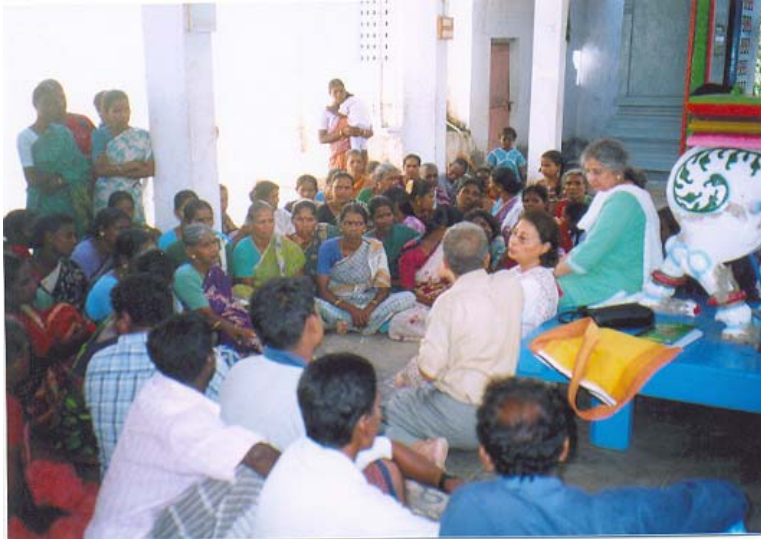
Meeting with the tsunami affected families who received support to build their lives

Pictures of visit to tsunami Rehabilitation project supported by the Foundation in Tamil Nadu