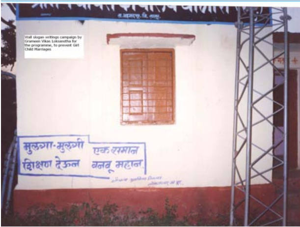
Awareness campaign in the village