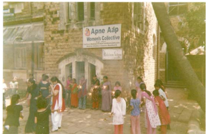
Girls celebrating Diwali at Apne Aap