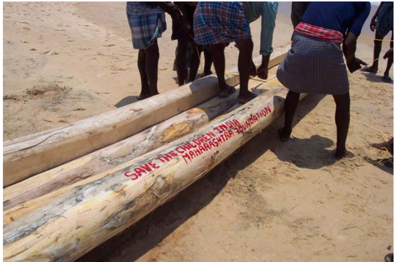
Assembled catamaran at the seashore