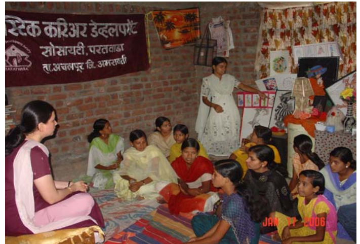
Adolescent group meeting held in January