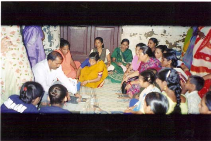
Mothers have formed a saving group for better and different future for their daughters