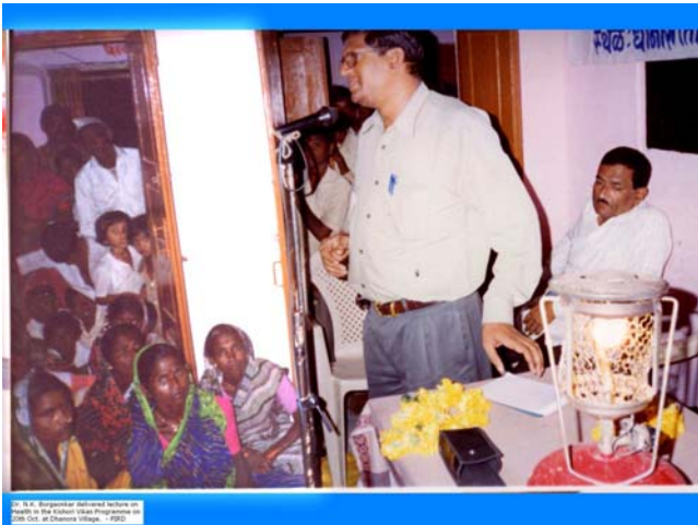
Health camp for women