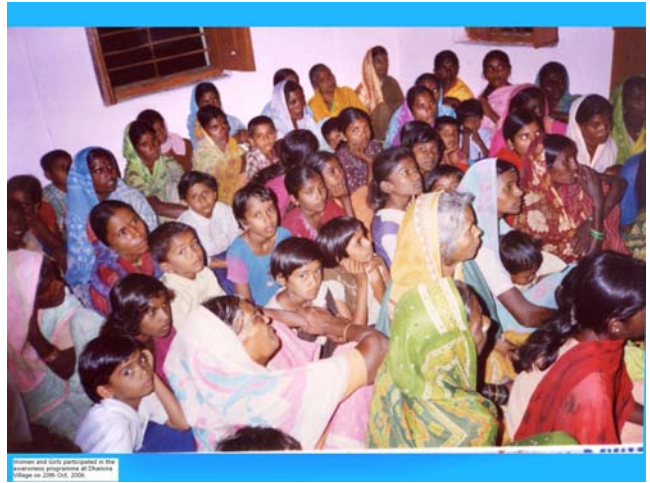
Awareness program for adolescent girls and their mothers