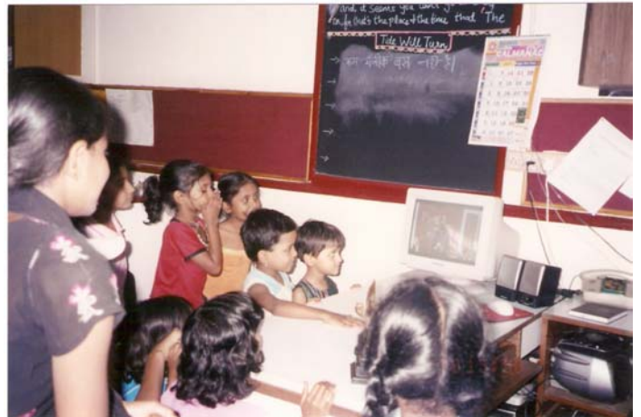
They also learn computer