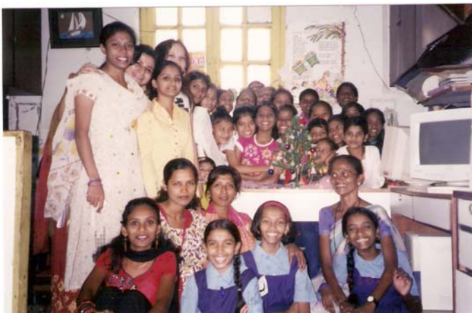
Girls from age 3 to 16 benefit from the project and they are happy to be at the NGO